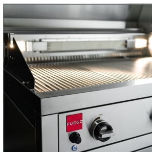
Interior Halogen Lights