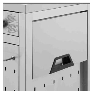
Recessed Side Shelves