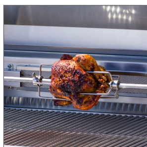
Rear Infrared Burner