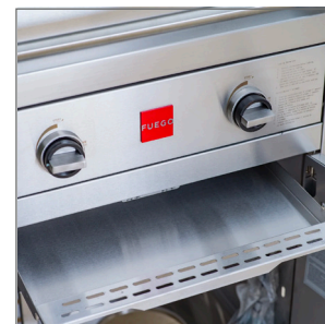
Hidden Residue Tray