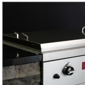
Griddle Top Cover