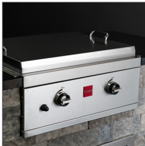
Sleek Front Panel Design