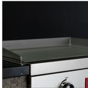
Heavy Duty 8mm Griddle