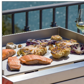
Meat, Veggies & More