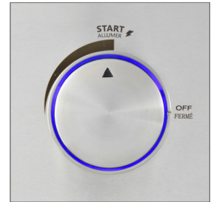
LED Backlit Knobs