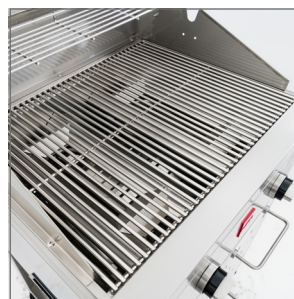
Heavy Duty 8mm Grates