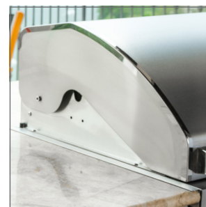
Easy Mount Side Brackets