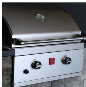
Sleek Front Panel Design