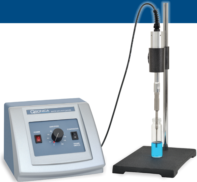
Stand sold separately.