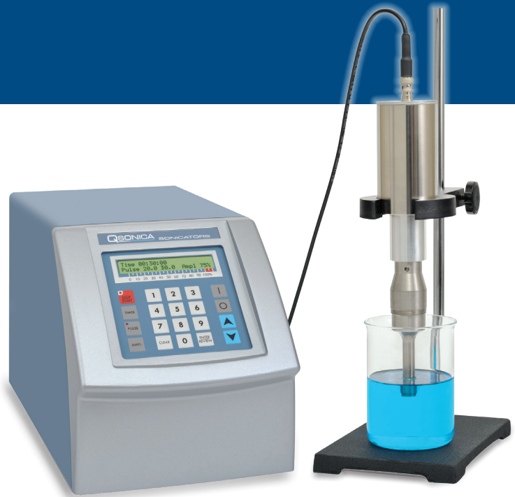
Stand sold separately.

Adjustable pulse On and Off times can be programmed from 1 second to 1 minute. Total programming has a maximum setting of 10 hours. A wide variety of probes and accessories are available to handle virtually any application.