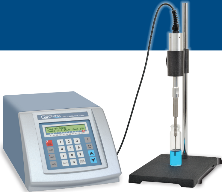
Stand sold separately.

The unit is effective for standard cell disruption, DNA/RNA shearing, homogenization and many other applications. The Q125 is ideal for small samples and for customers that do not plan to scale up to larger volumes in the future. This model offers the same programming and display features as the Q500 unit.