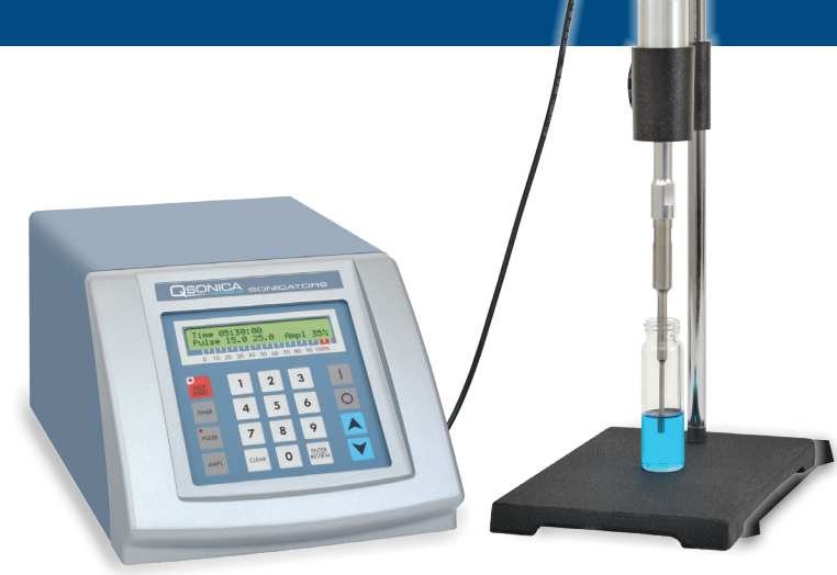
Stand sold separately.