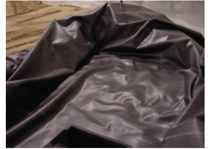
The liner covers the stream bed and goes thru the area where the spillway will set.

Once you have sculpted the reservoir, stream and waterfall area carefully check for any rocks, roots or sharp objects in the soil. After ensuring the area is free from objects you can install the underlayment thru the reservoir and stream area. After installing the underlayment you can install the liner as well. Do not be concerned with a few wrinkles in the liner since the whole area will be filled in with rock and covered. Be sure to pull any extra liner towards the waterfall area.