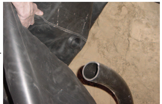
Stretch liner over bulkhead then tighten washer and nut onto bulkhead

Remove the channel grating from the top of the spillway. There are openings on both ends of the spillway for water to enter. You will need to decide which end is more convenient for your application. First you need to plug the opening you will not be using. Install the bulkhead fitting with the body and the rubber gasket on the inside of the tub. Tighten the plastic washer and the nut from the outside. Install pvc plug on the inside of the tub and tighten. If you are using a large spillway often times water will come in from both ends in which case you would not use the plug but rather install a pvc male adapter on the outside of the bulkhead.