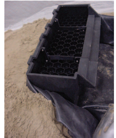
The liner goes under the spillway and wraps up the back and ends.

On the incoming side you will need to hold the liner up to the end of the tub and mark where the bulkhead hole is. Cut a hole in the liner slightly smaller than the opening. Set the spillway tub in place and push the body of the bulkhead thru from the inside (be sure rubber gasket is in place inside the tub). Stretch the liner over the bulkhead and then install the washer and the nut. Tighten the nut snugly but do not overtighten. This will create a waterproof seal thru the liner.