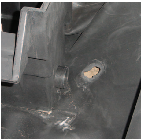
Hold bulkhead to spillway and cut hole in liner just smaller than bulkhead.

Remove the channel grating from the top of the spillway. There are openings on both ends of the spillway for water to enter. You will need to decide which end is more convenient for your application. First you need to plug the opening you will not be using. Install the bulkhead fitting with the body and the rubber gasket on the inside of the tub. Tighten the plastic washer and the nut from the outside. Install pvc plug on the inside of the tub and tighten. If you are using a large spillway often times water will come in from both ends in which case you would not use the plug but rather install a pvc male adapter on the outside of the bulkhead.