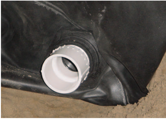
Bulkhead is thru liner, washer and nut are tightened and PVC adapter is installed.

On the incoming side you will need to hold the liner up to the end of the tub and mark where the bulkhead hole is. Cut a hole in the liner slightly smaller than the opening. Set the spillway tub in place and push the body of the bulkhead thru from the inside (be sure rubber gasket is in place inside the tub). Stretch the liner over the bulkhead and then install the washer and the nut. Tighten the nut snugly but do not overtighten. This will create a waterproof seal thru the liner.