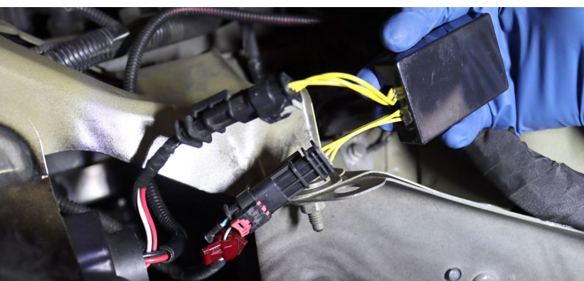
To finalize the installation, kindly follow the same process for the other side of the headlight.