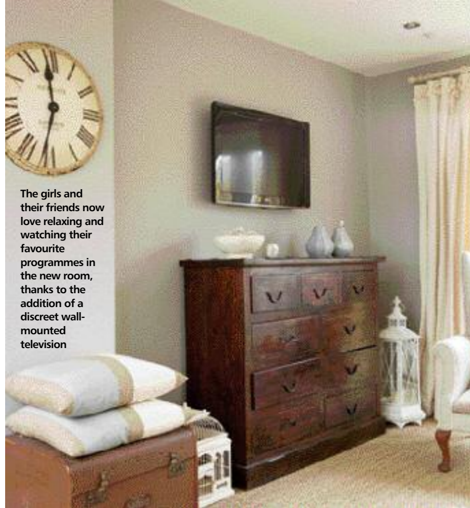
The girls and their friends now love relaxing and watching their favourite programmes in the new room, thanks to the addition of a discreet wall-mounted television