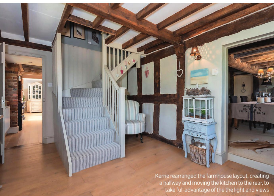
Kerrie rearranged the farmhouse layout, creating a hallway and moving the kitchen to the rear, to take full advantage of the light and views