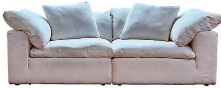
Sink into the bliss of a deep-fill sofa darlingsofchelsea.co.uk