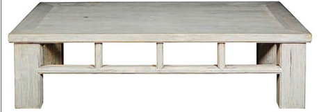
Kerrie paints her wooden furniture to ensure a perfect match throughout, but you can find ready painted pieces, kayhome.co.uk