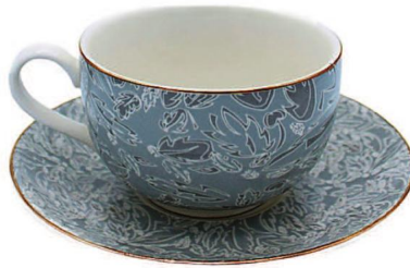
Nothing says farmhouse chic like a pretty teacup milysands.co.uk