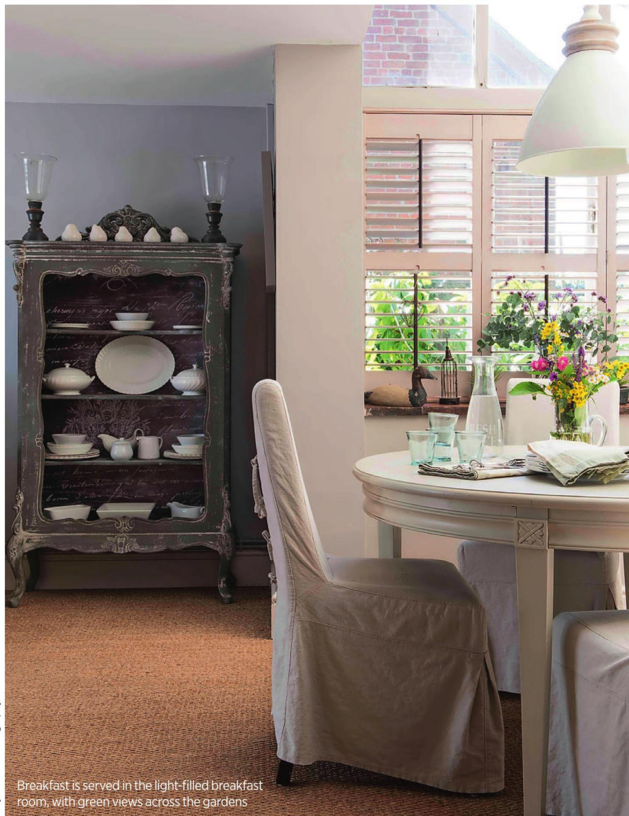
Breakfast is served in the light-filled breakfast room, with green views across the gardens