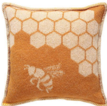
Add a pop of colour, but don't mix it up jjtextile.co.uk