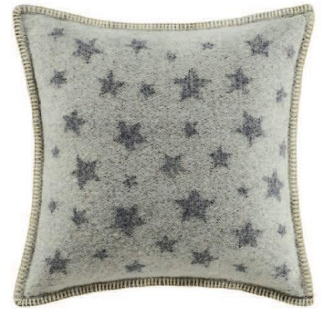
Choose cushions that work as a set jjtextile.co.uk