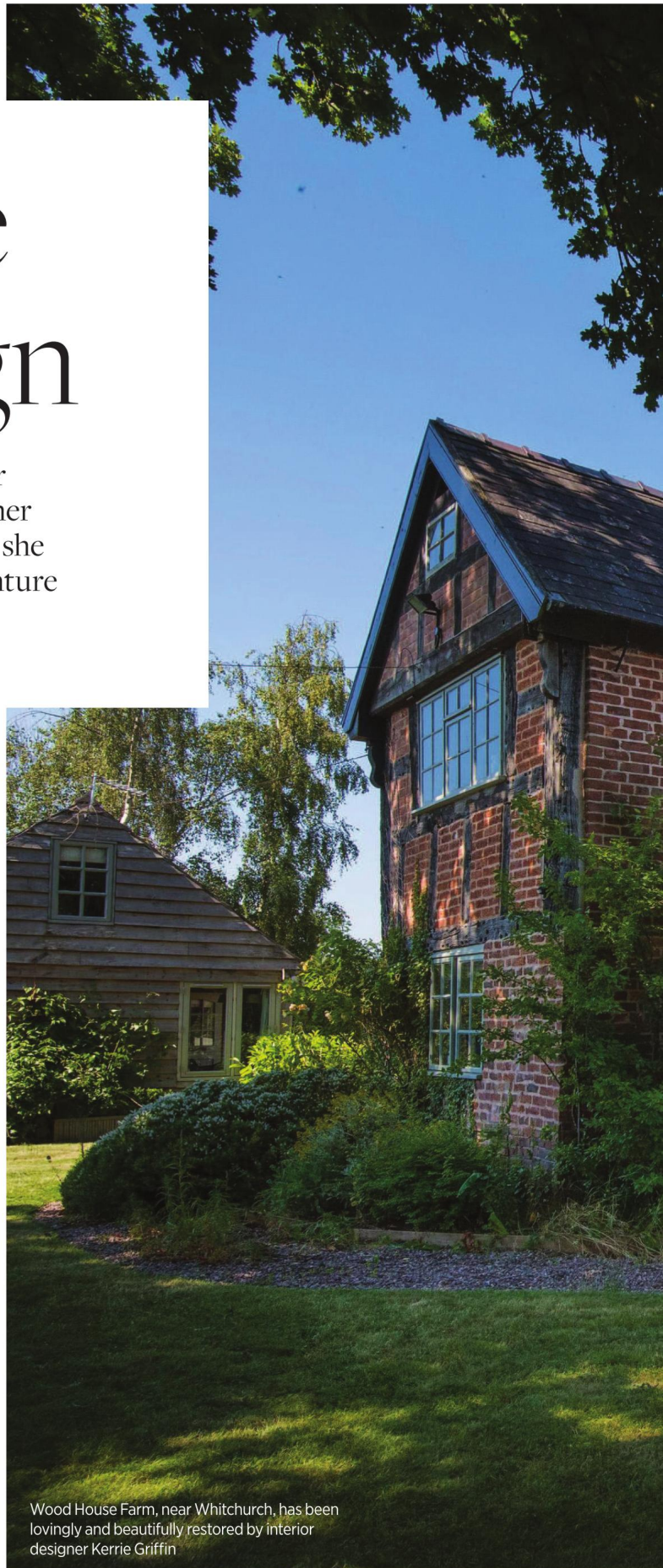
Wood House Farm, near Whitchurch, has been lovingly and beautifully restored by interior designer Kerrie Griffin

Kerrie sets a strong example for what it means to be self-sufficient: she can make things out of wood, plaster walls, put in RSJs, take a brick wall down, paint, upholster, make curtains, make clothes, cook and do a bit of plumping. 'I can ▶