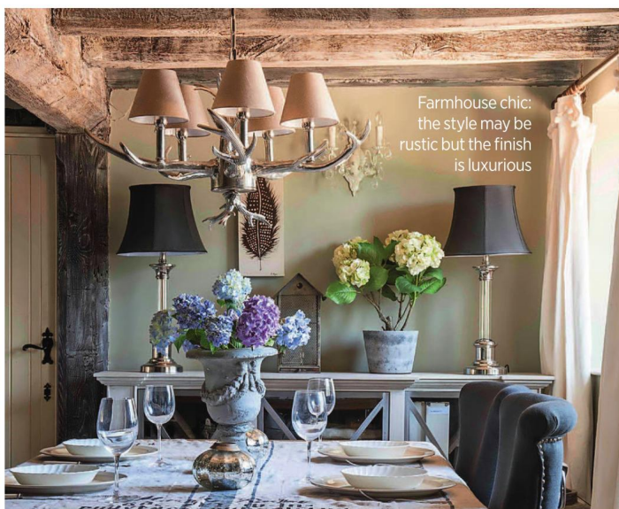
Farmhouse chic: the style may be rustic but the finish is luxurious