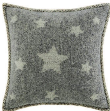
Scatter cushions add interest, texture and comfort jjtextile.co.uk