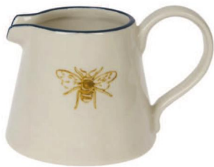
A pretty jug for flowers or milk sophieallport.com