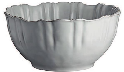
Accessorise in complementary colours hudsonhome.co.uk