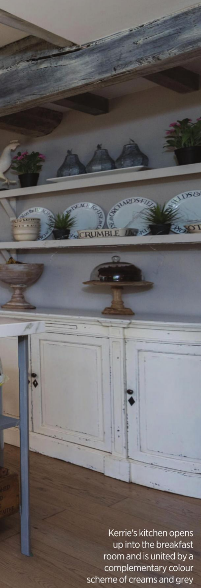
Kerrie's kitchen opens up into the breakfast room and is united by a complementary colour scheme of creams and grey