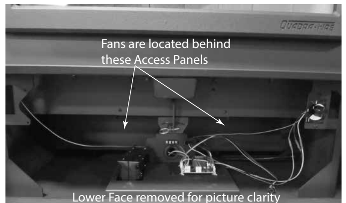
Figure 4.12 Fan Locations