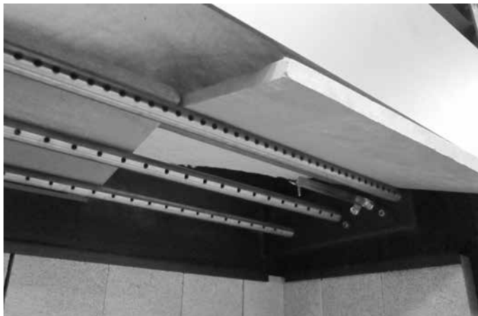
Figure 4.9 Baffle Board Locations