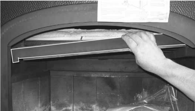
Figure 4.8 Removing Baffle Protection Channel