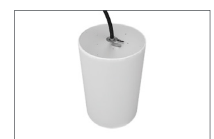
WARNING: To avoid breaking or damaging the top or bottom edge groove of your display, lower gently onto ground when assembling and disassembling. Do not drop counter or tip over any time.

Step 8: Repacking. Deflate the counter and leave the fabric graphic and countertop attached to the display.