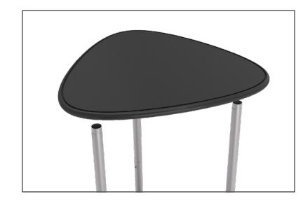
Step 7: Tap down base with hand to secure. Turn counter back over.