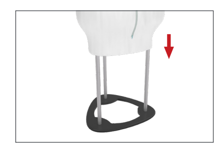
Step 8: Complete.