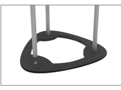
Step 6: Turn counter upside-down. Pull graphic taut and angel and tuck gasket into channel in edge of base. Insert graphic gasket all the way around.