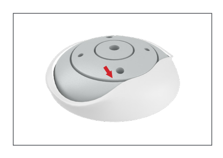
Step 7: Insert display frame into base by pushing post into hole.

Step 3: Flip base over carefully to prevent damage to graphic and repeat Step 2 for top groove.