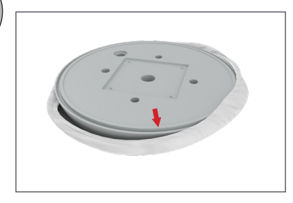
Step 6: Zip the two edges of graphic to the center point as shown.

Step 2: In a clean, dry area, assemble the fabric onto the base by angling and tucking the silicone gasket into the bottom groove.