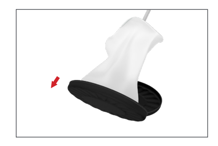
Step 8: Complete.