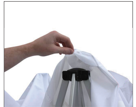
6. Make sure canopy is flush on hardware