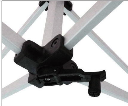
11. Spin winder in the center of the frame to completely tighten tent