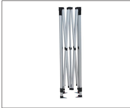
2. Place feet on stable ground