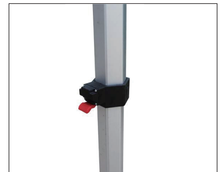
9. Lift the 2 adjacent outer legs and slide out the inner legs until the snap button locks into the hole in the outer leg