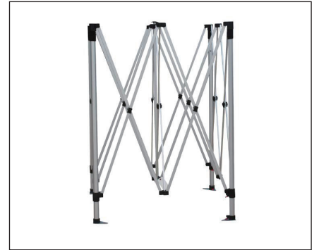
3. Extend frame to extended size of 4' x 4'