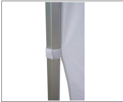
14. Secure to side poles with Velcro strips (x4 per pole)