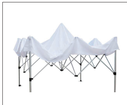
7. Lift inside pole in center to extend frame completely