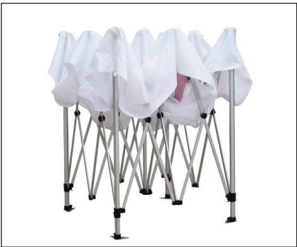
4. Lay canopy over top of frame