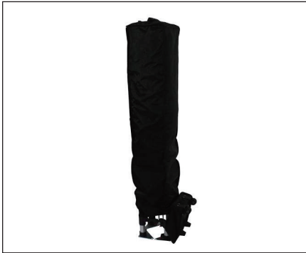
1. Remove from bag