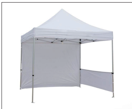
17. Halfwall assembled