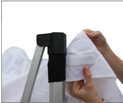
5. Align the canopy top over the frame corners and place Velcro on all 4 corners (none on top piece)