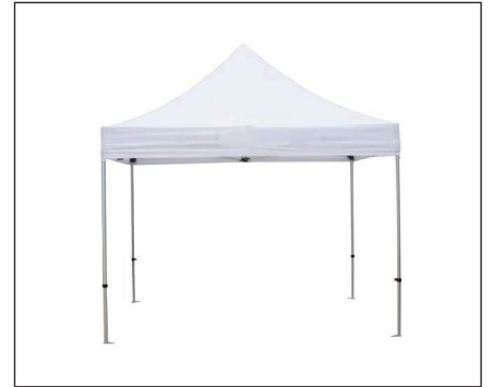
12. Canopy kit assembled