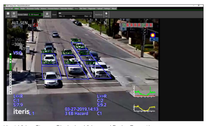
Next Video Stream Displaying Video and Radar Operation