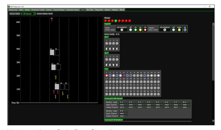
Vector on Next - Radar Zone Operation