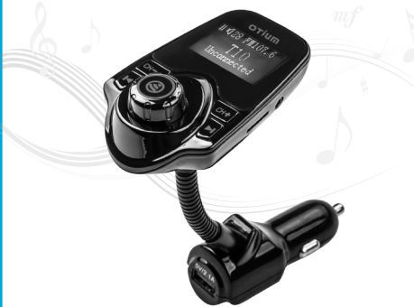
T10 Multifunction Wireless Car MP3 Player