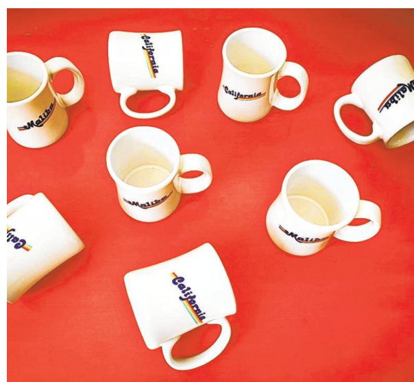
One Gun Ranch