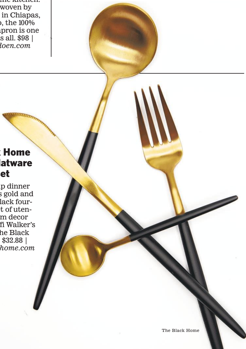
The Black Home

Spice up dinner with this gold and matte black four-piece set of utensils from decor guru Neffi Walker's label, the Black Home. $32.88 | theblackhome.com