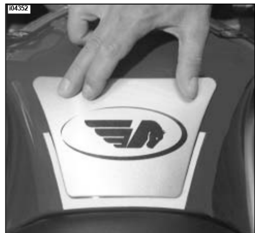
Figure 2. Positioning Airbox Cover in Template