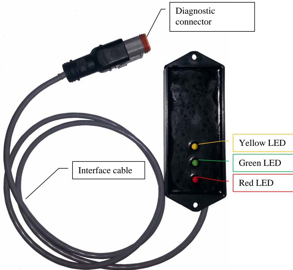
Table 1: The Status LEDs indicate power, communication, and calibration status.

CMI (Control Module Interface) Lite is a hand-held service tool for EFI-equipped Buell™ motorcycles. This tool allows the user to read ECM historic trouble codes, clear historic codes, check the idle position, and reset the Throttle Position Sensor. The tool uses the standard diagnostic port to communicate with the ECM.