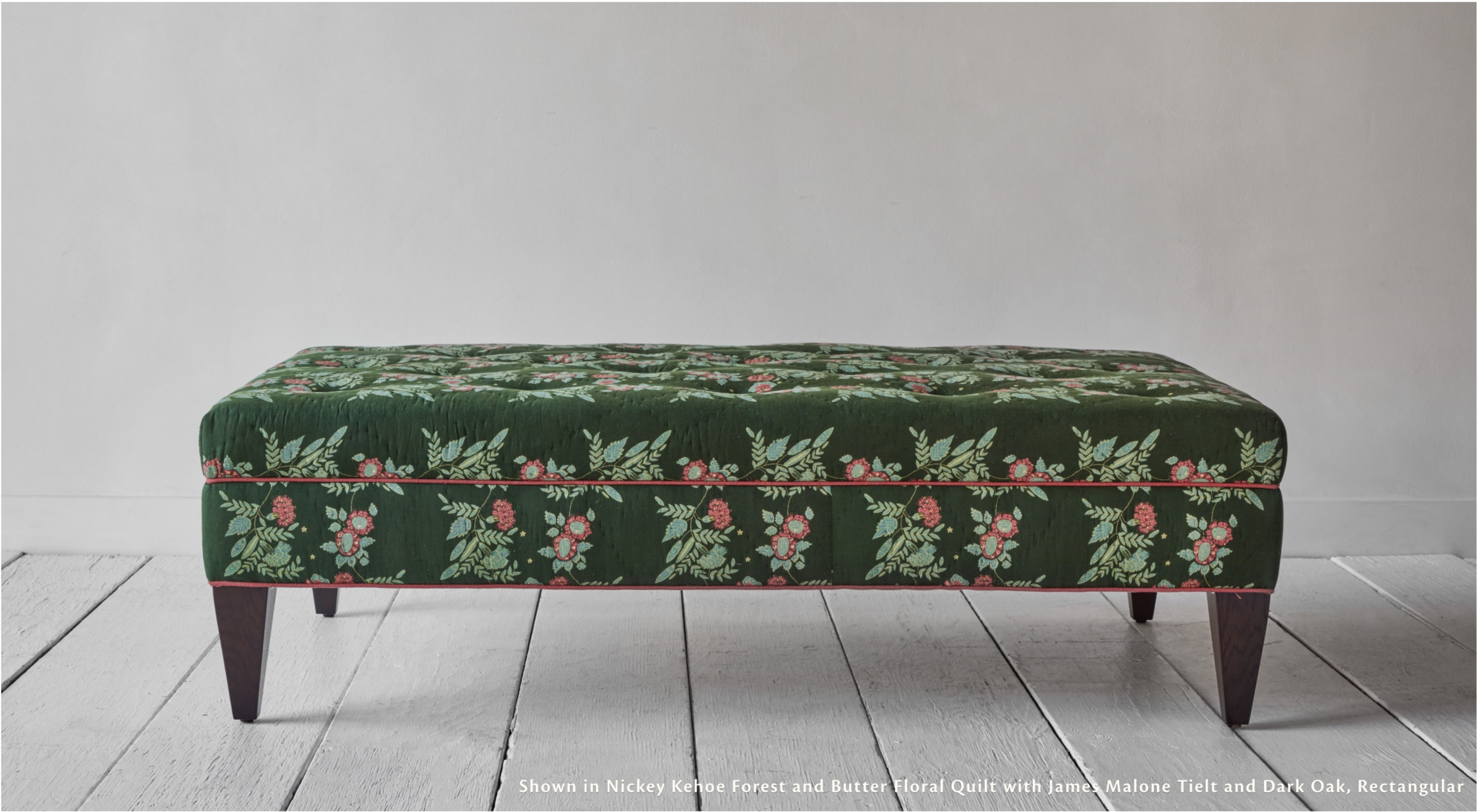
Shown in Nickey Kehoe Forest and Butter Floral Quilt with James Malone Telt and Dark Oak, Rectangular

This clever little upholstered ottoman gives a hint of rococo glam with deep tufts and square tapered white oak legs. A curiously beautiful alternative to a traditional coffee or side table, it is designed to fit your needs, from a living room accent piece to a fireside staple.