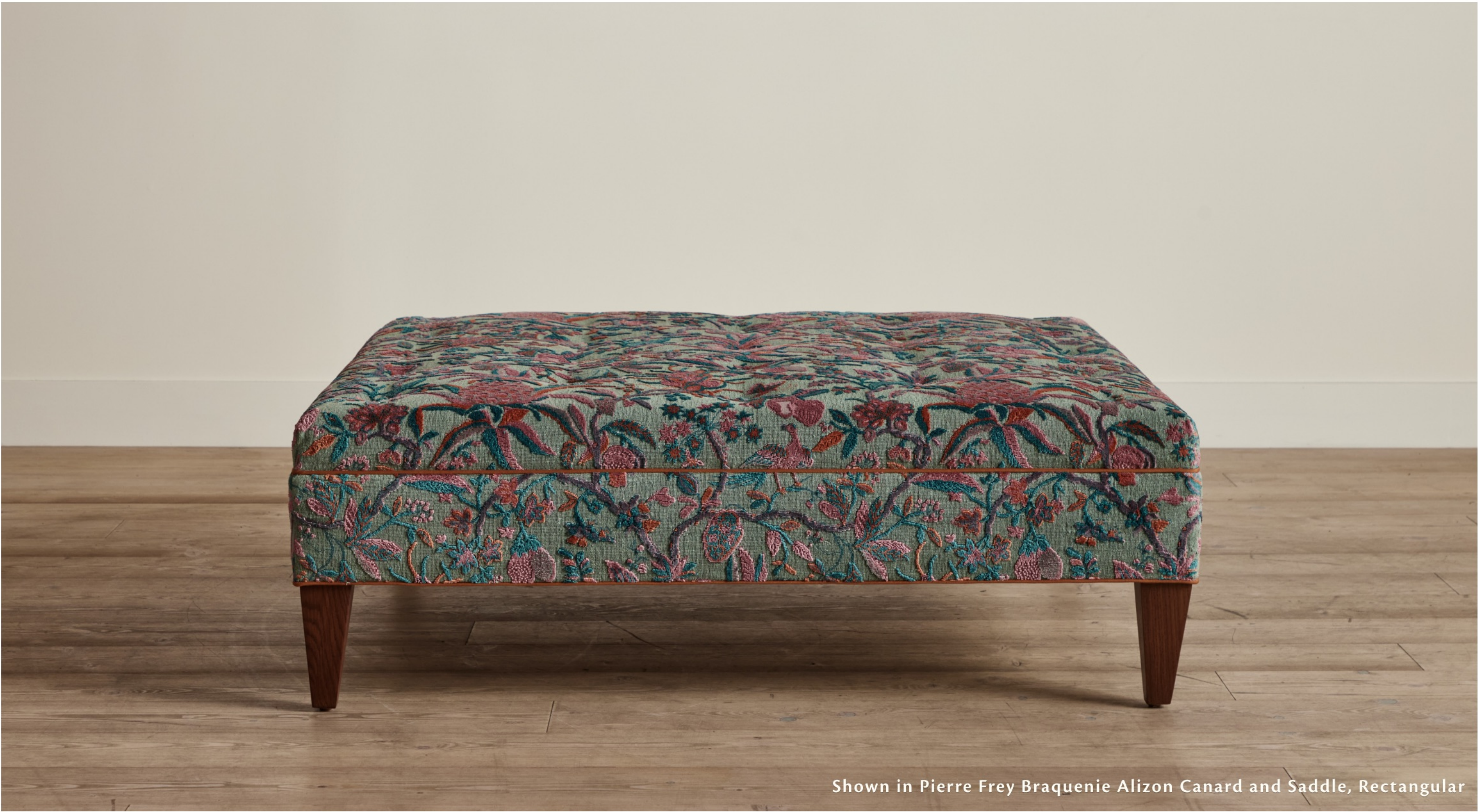
Shown in Pierre Frey Braquenie Alizon Canard and Saddle, Rectangular

This clever little upholstered ottoman gives a hint of rococo glam with deep tufts and square tapered white oak legs. A curiously beautiful alternative to a traditional coffee or side table, it is designed to fit your needs, from a living room accent piece to a fireside staple.