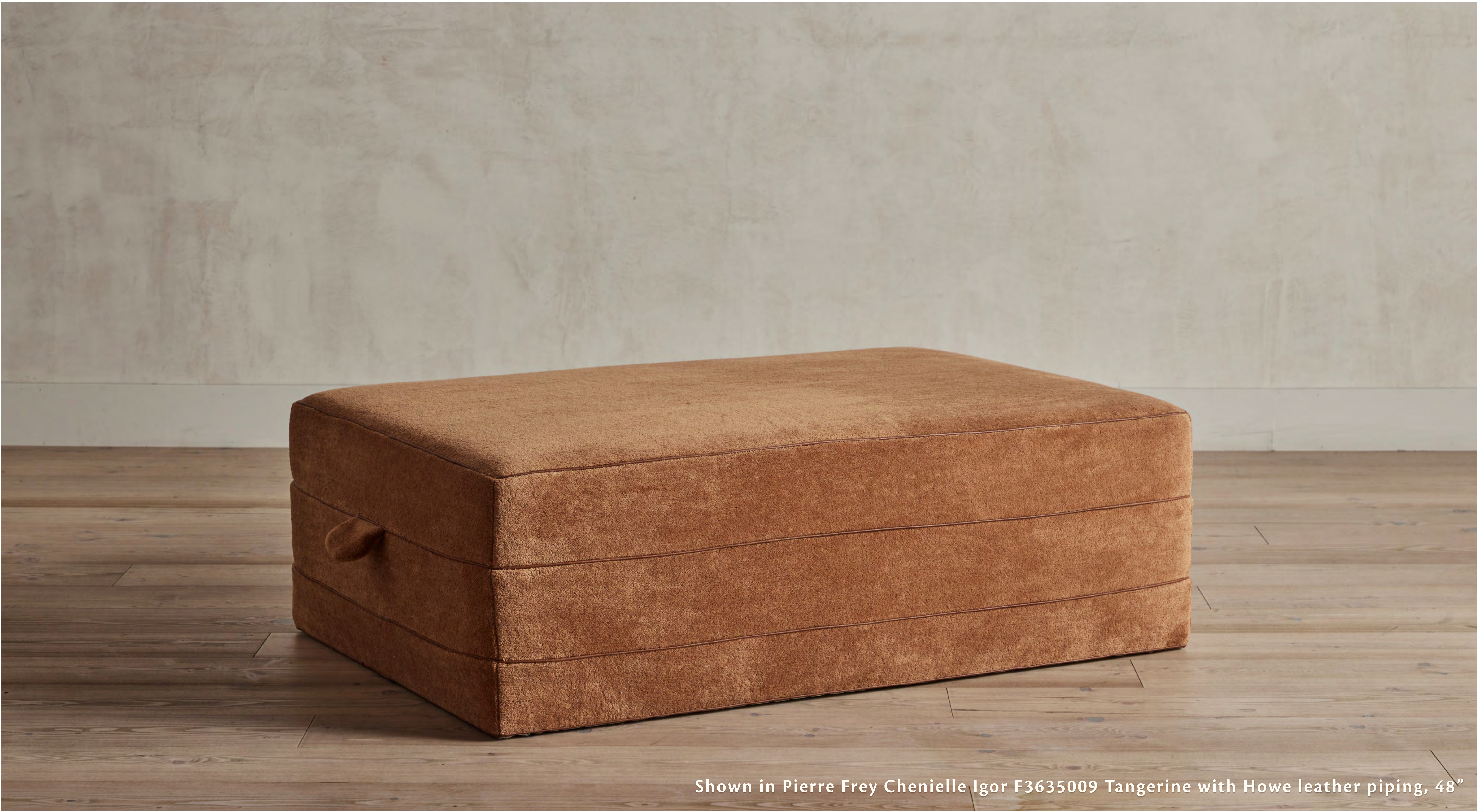
Shown in Pierre Frey Chenielle Igor F3635009 Tangerine with Howe leather piping, 48"

With a solid oak frame and impeccable upholstery, this hassock is a charming companion piece. Two-ring piping and double handle details comprise a winsome accent seat, ideal for your living room, bedroom, or walk-in closet. Available in custom sizes.