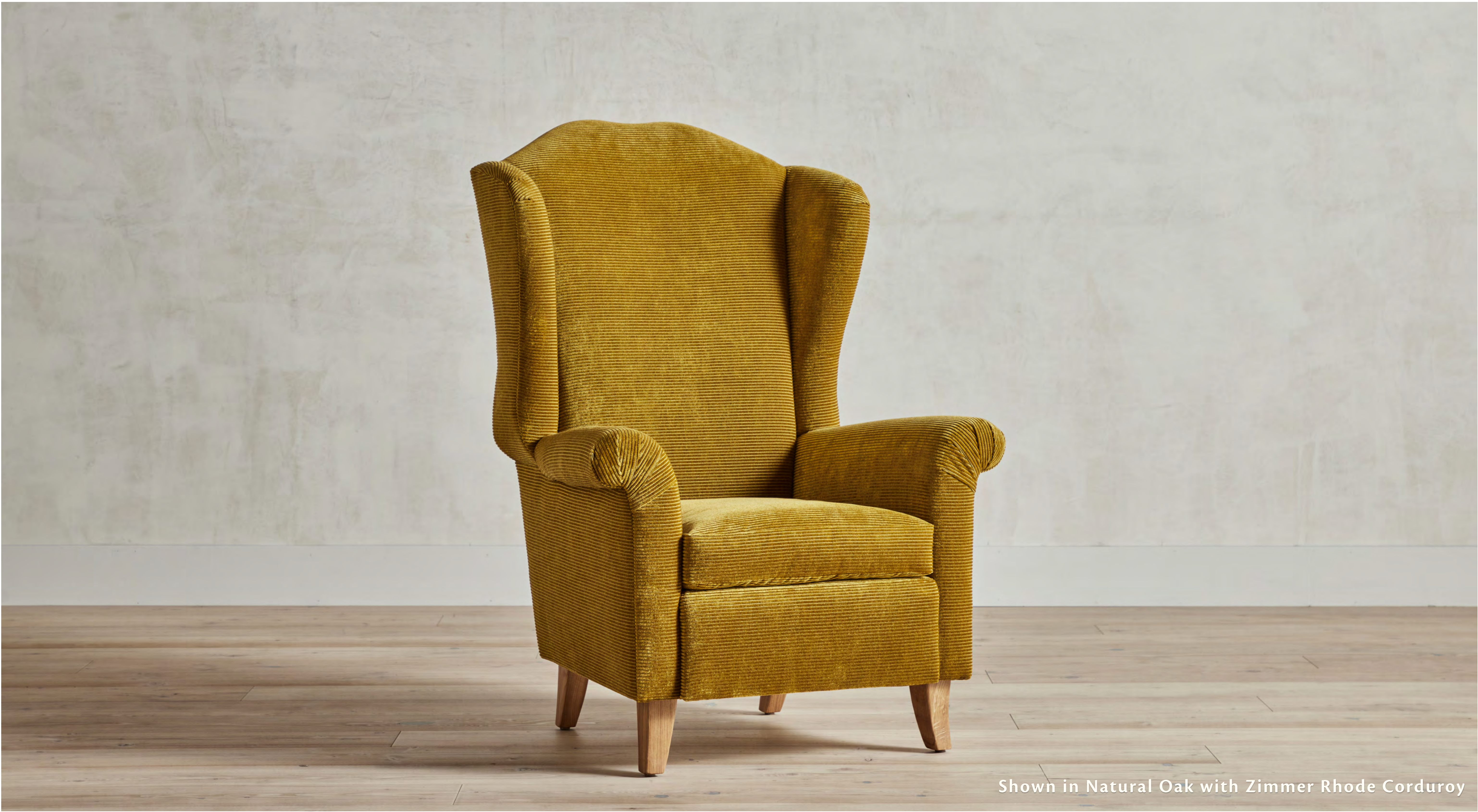
Shown in Natural Oak with Zimmer Rhode Corduroy

To rethink the wingback, we looked to Italy, where the wildly experimental sits arm and arm with the formative classics. This revitalized wingback chair is designed with minimalized proportions - without sacrificing heft and comfort. A low-slung seat gives the design a loose, improvisational feel, finished in warm walnut and natural oak tones.