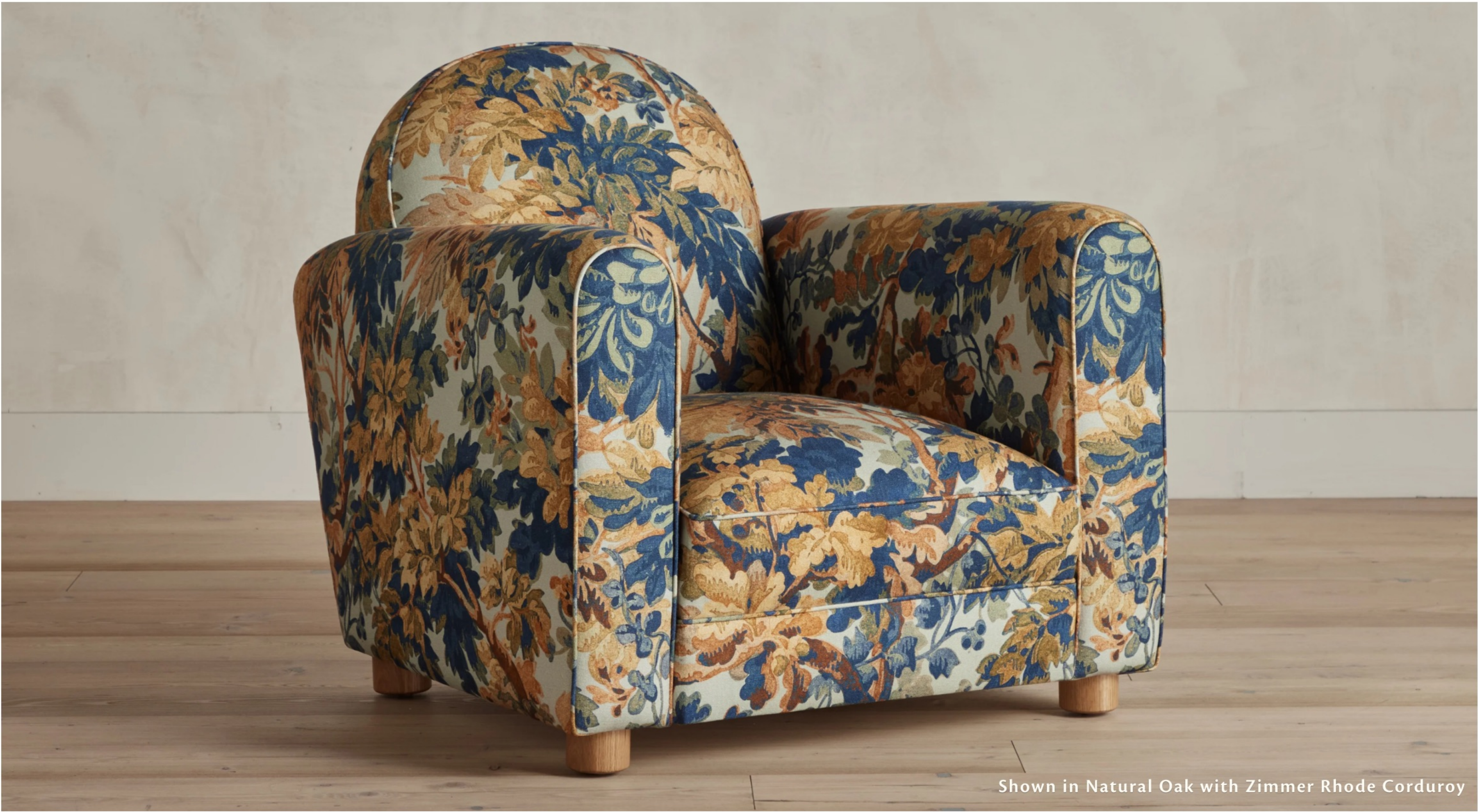
Shown in Natural Oak with Zimmer Rhode Corduroy

Our forward-thinking take on the classic 1930s Parisian Club Chair features pared down line-work with gently sloping arms. A taut cushion with a down-feather crown sits atop a high-density foam core, carefully considered with increased depth and an elegantly tailored width, finished with a white oak peg foot.