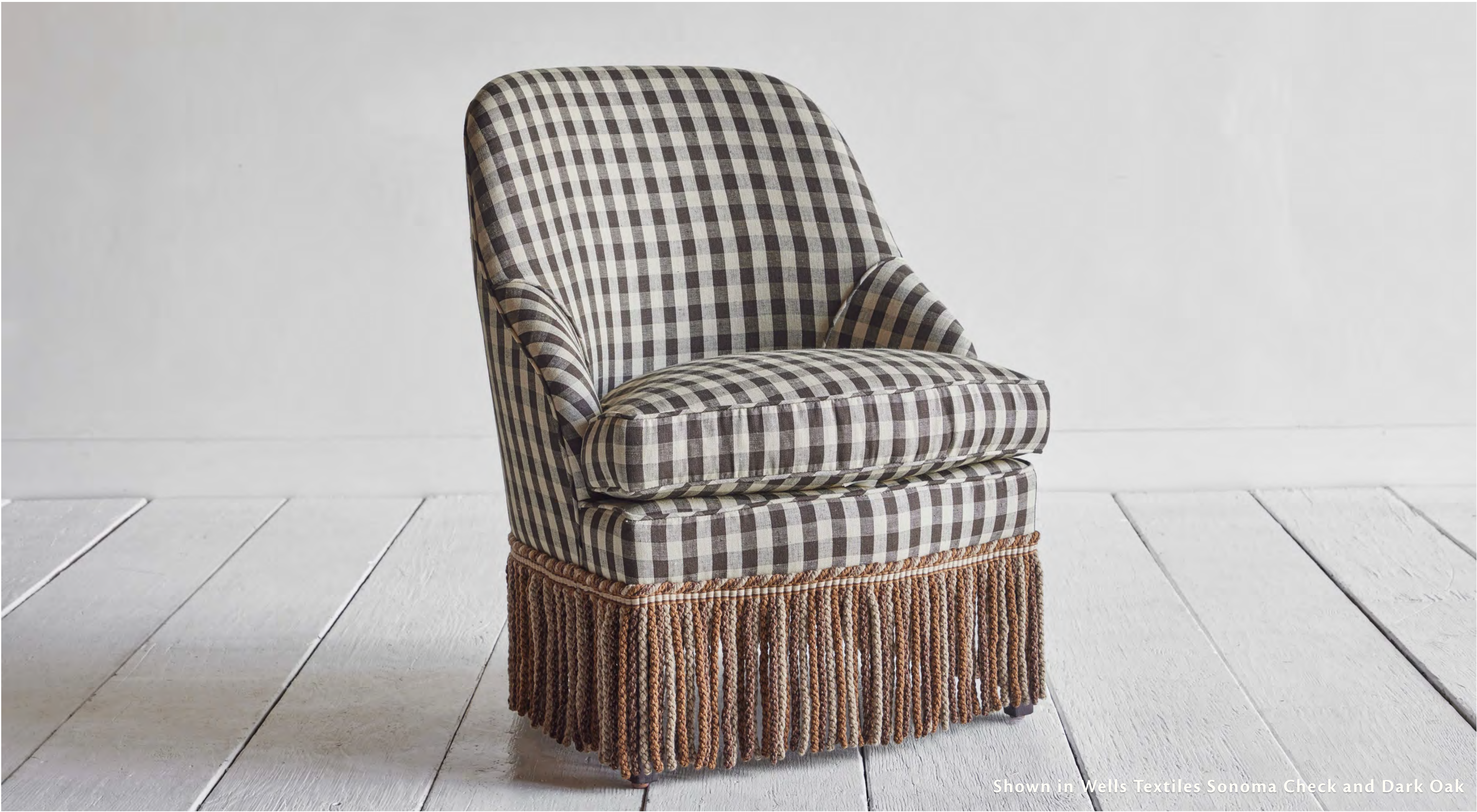
Shown in Wells Textiles Sonoma Check and Dark Oak

Inspired by the Napoleon III style, this lounge-height chauffeuse is scaled for modern living. A bullion fringe skirts gently above solid oak legs, and a carefully considered pitch and down feather interior invites extensive lingering. A fully removable seat cushion cover with back zip closure and clips makes this chair a versatile, benevolent presence in your home.