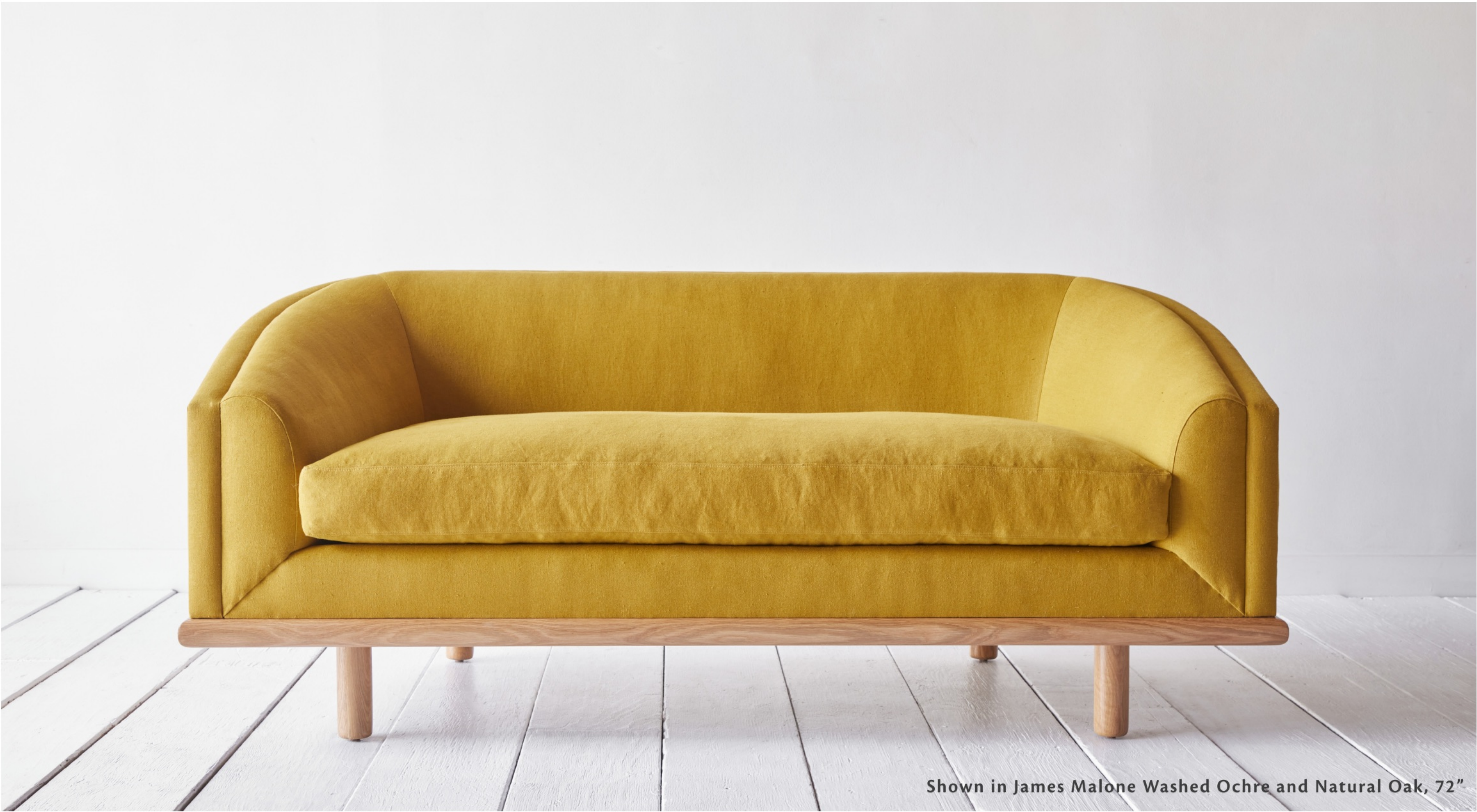
Shown in James Malone Washed Ochre and Natural Oak, 72"

Our sublimely sculptural sofa invites relaxation and conversation with a curved silhouette and generous depth. The supple seat is infused with luxurious organic down, and its solid oak framed base sits atop classic cylindrical legs, creating a lovely, intuitive curve that effortlessly draws the eye. Available in two lengths.