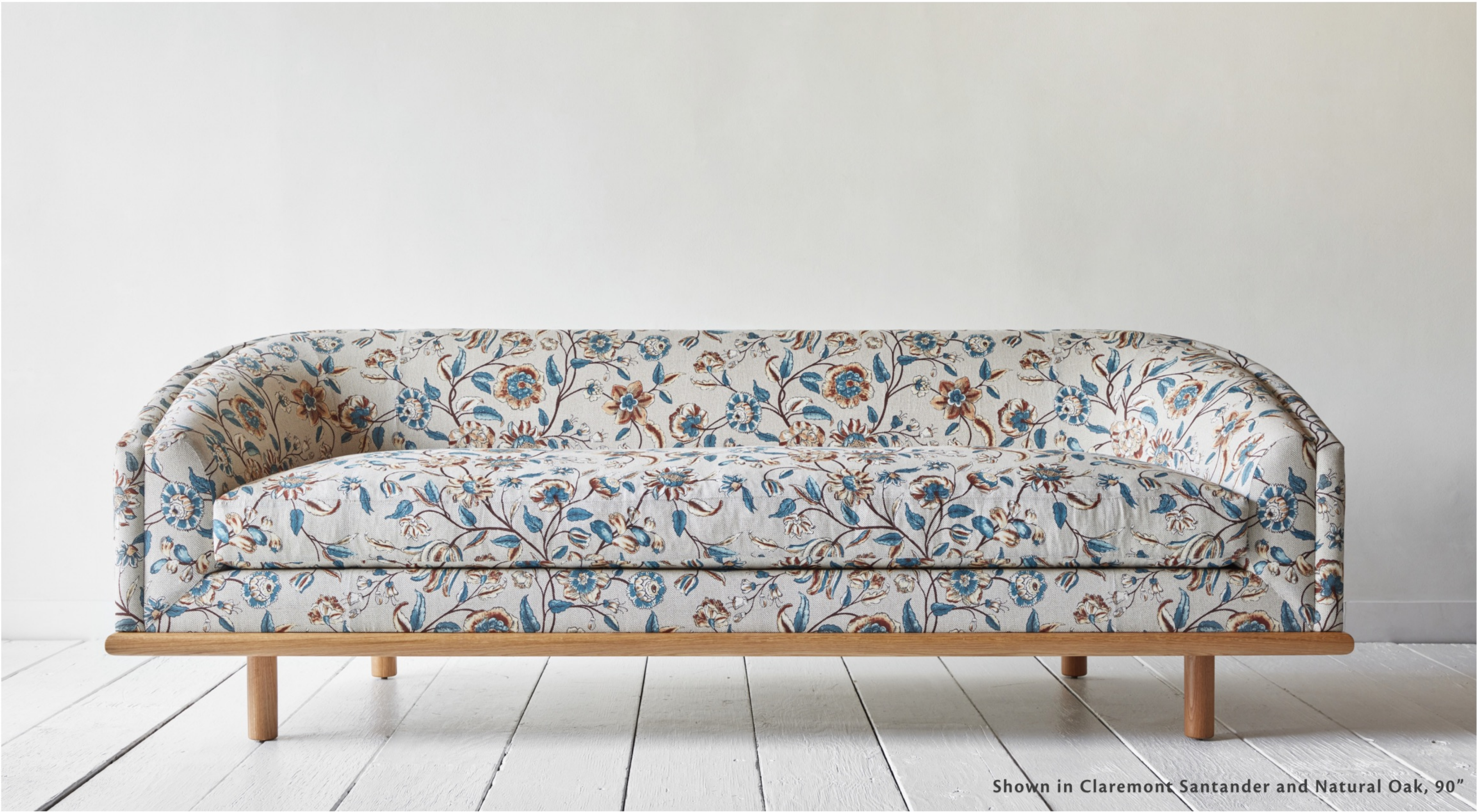
Shown in Claremont Santander and Natural Oak, 90"

Our sublimely sculptural sofa invites relaxation and conversation with a curved silhouette and generous depth. The supple seat is infused with luxurious organic down, and its solid oak framed base sits atop classic cylindrical legs, creating a lovely, intuitive curve that effortlessly draws the eye. Available in two lengths.