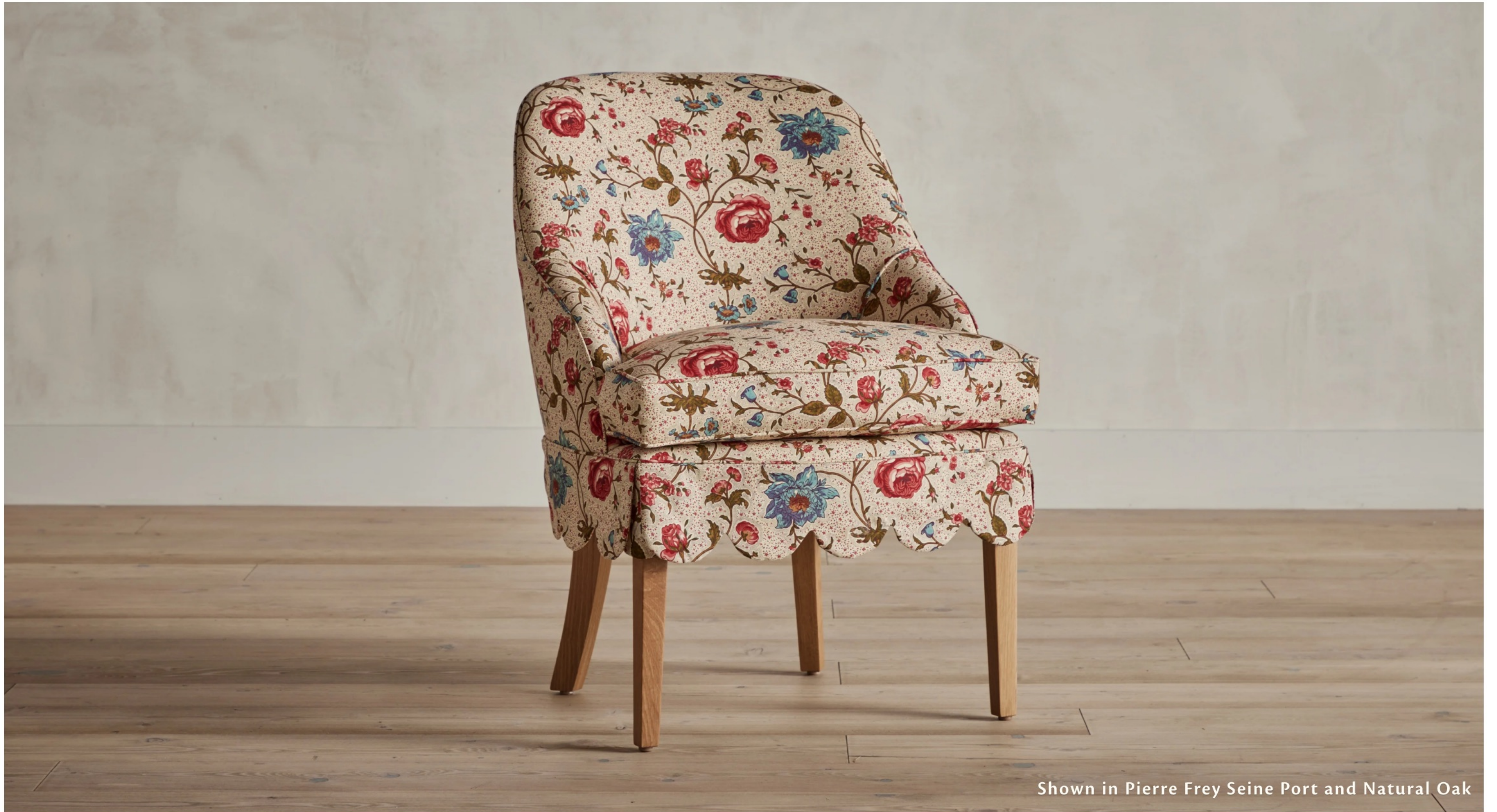
Shown in Pierre Frey Seine Port and Natural Oak

Our simplified expression of a classic Napoleon III slipper chair is finished with a pared-down scallop-edged skirt, designed with a lumbar pitch for table-side seating. The seat cushion features a down feather crown for flexibility on either side, while a removable cover with back zip closure and corner tie-downs maintain each chair's essential character - sophisticated, impeccably designed, but not taking itself too seriously.