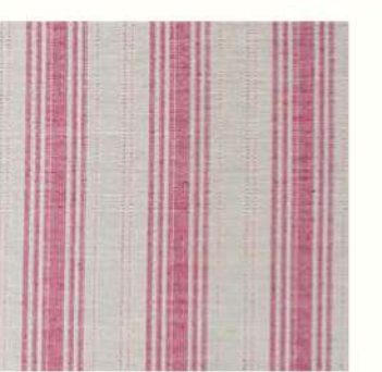
Marmaris Sage - Fully Reversible