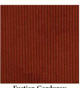
Fustian Corduroy Amber