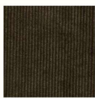
Fustian Corduroy Olive