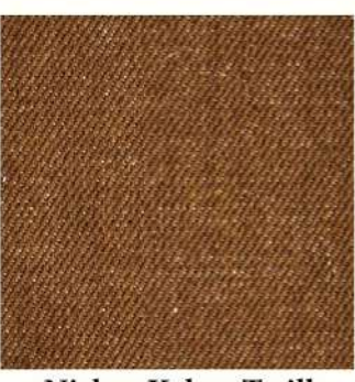
Nickey Kehoe Twill Walnut