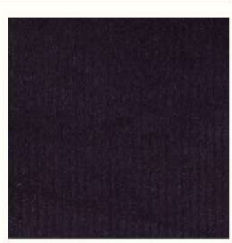
Fustian Corduroy Navy