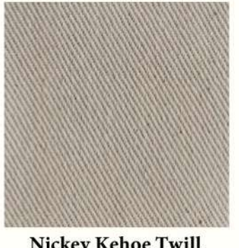
Nickey Kehoe Twill Natural