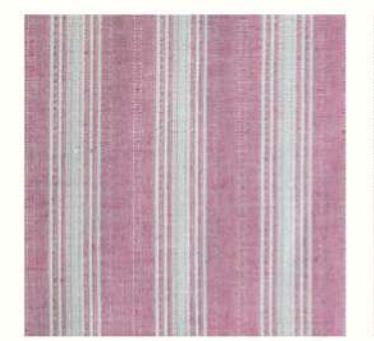
Marmaris Reversible Stripe Petra Pink - Fully Reversible