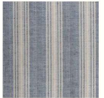
Marmaris Reversible Stripe Galata - Fully Reversible