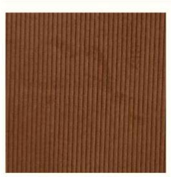
Fustian Corduroy Camel