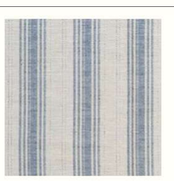
Marmaris Reversible Stripe Bluebell - Fully Reversible