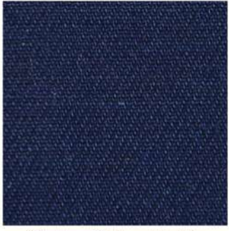
Nickey Kehoe Twill Dark Navy