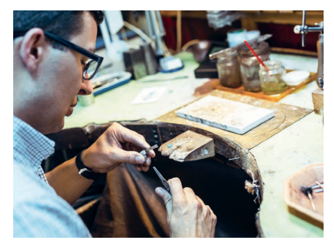
Cleaning in the jewellery industry (e.g. necklaces, earrings, bracelets, rings, etc.)

Elmasonic xtra ST devices are rated for continuous operation under the highest operational demands. The tanks are made of special stainless steel, which makes them robust with a long service life. In single-shift operation, they are guaranteed a warranty period of three years.