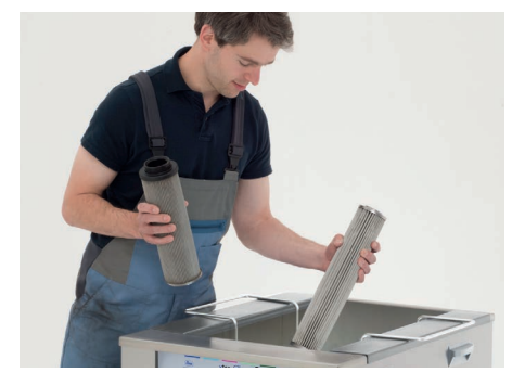
Industrial parts cleaning in workshops, production and servicing as well as for overhaul cleaning