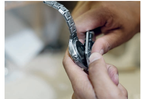
Cleaning in watch manufacture (e.g. bottom cases, watch straps, etc.)