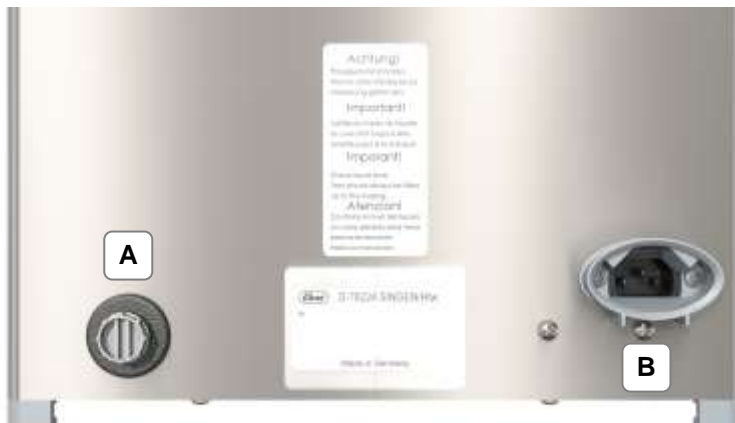
Illustration 4.6 Unit back view (as delivered)