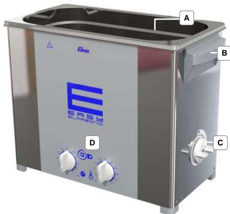
Illustration 4.5 Front view / side view Elmasonic EASY 30 H