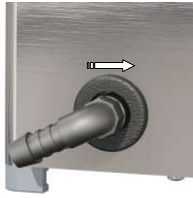
Illustration 5.1.2 Drain fitted with standard tube