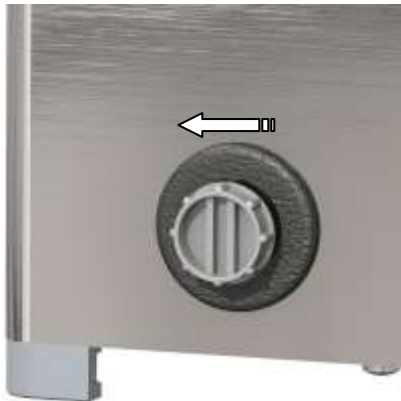
Illustration 5.1.1 Drain with plastic screw cap