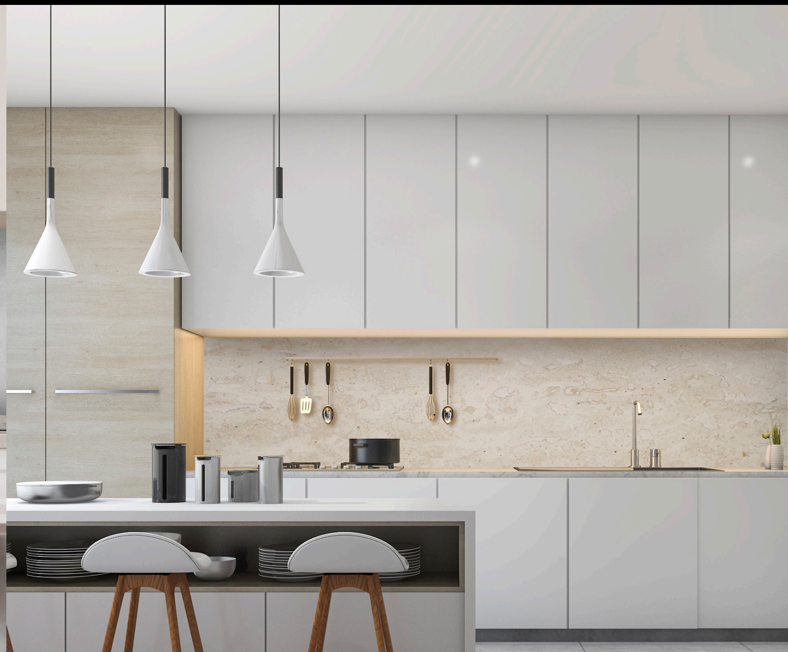
Kitchen splashback in Travertine

The kitchen is the heart of every home, and in recent years the humble splashback has evolved to become an important focal point in your new kitchen. Reflections is proud to present the first of its new Designer Range Splashbacks.