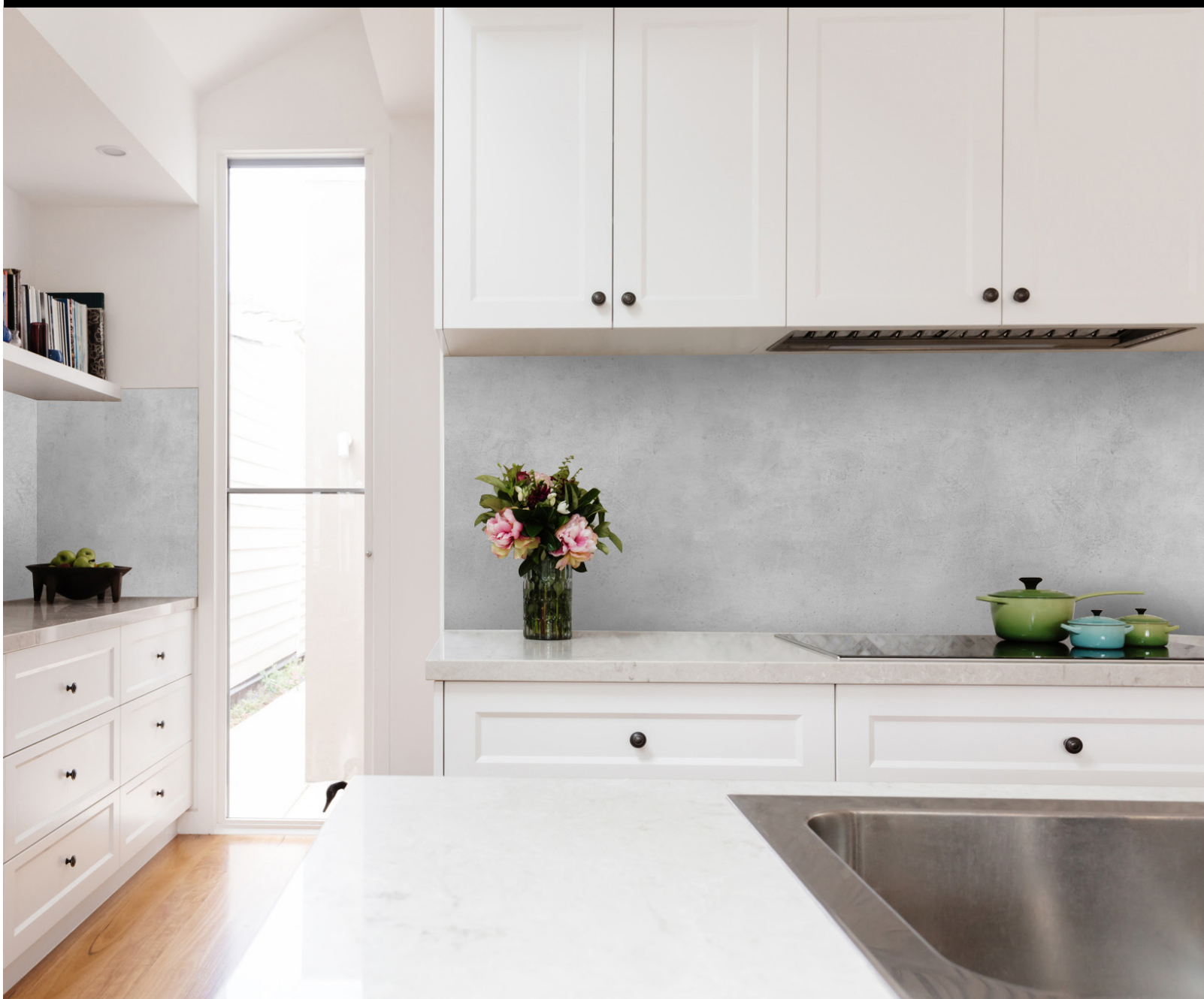
Kitchen splashback in Concrete