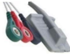
VitalsRx Professional with ECG Electrodes and Pulse Oximeter