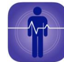
VitalsRx BodiMetrics, LLC Free