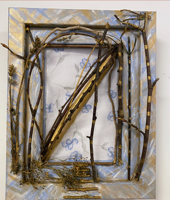
Artist: KAREN ROSE Title: FRAGILE PATH Medium: NATURAL OBJECTS Price: NOT FOR SALE