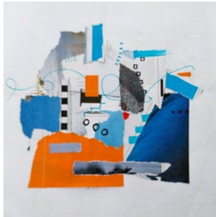
by Mandy and Carolyn Work images included: Collage on paper 20cm x 20cm and mixed media mobile 1m x 1m