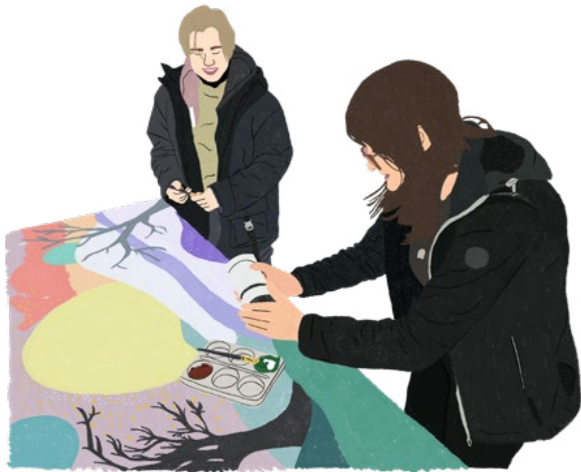
Collaborating on a large painting in the studio

Studio Sessions are set up as an additional pathway for Xpres! participants to engage in smaller groups.