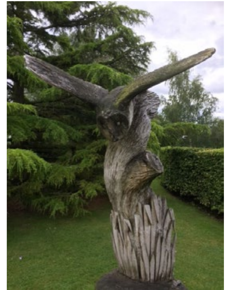
One of the beautiful sculptures at Nature in Art

Cinderford Artspace provided circus activities, we watched a film with footage from all the previous sessions and then ate pizza amongst the sculptures in the sunshine.