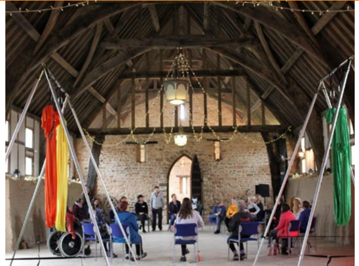
One of our sessions in the stunning Tithe Barn