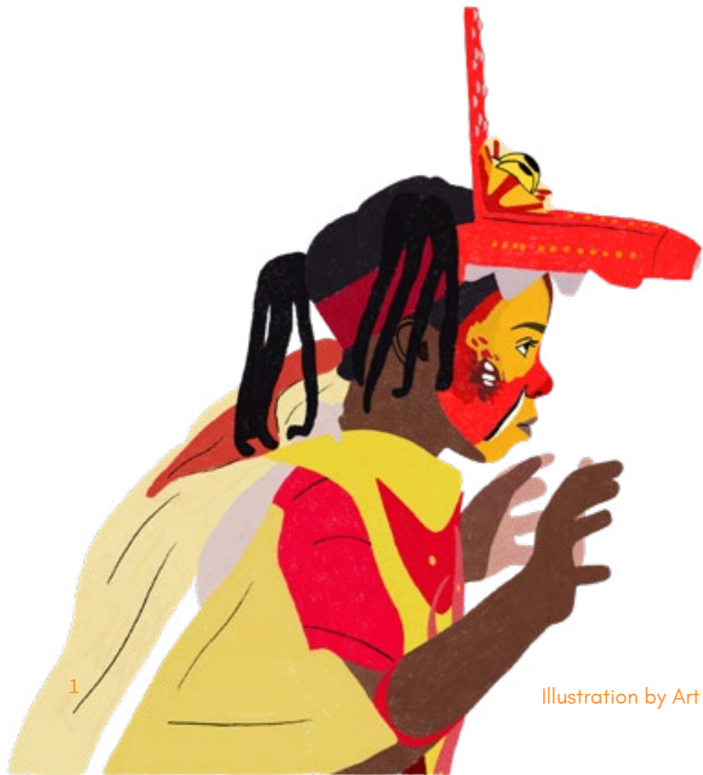
Illustration by Art Shape volunteer Sherina Steele @sherinasteelart

We recognise individual value and worth built on mutual respect, warmth and integrity .