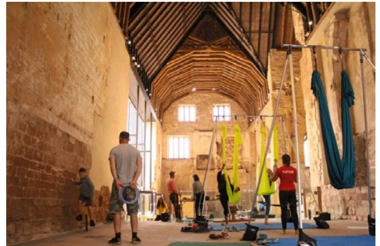
Summer school 'Blackfriars Buzz' at Blackfriars in Gloucester July 2021