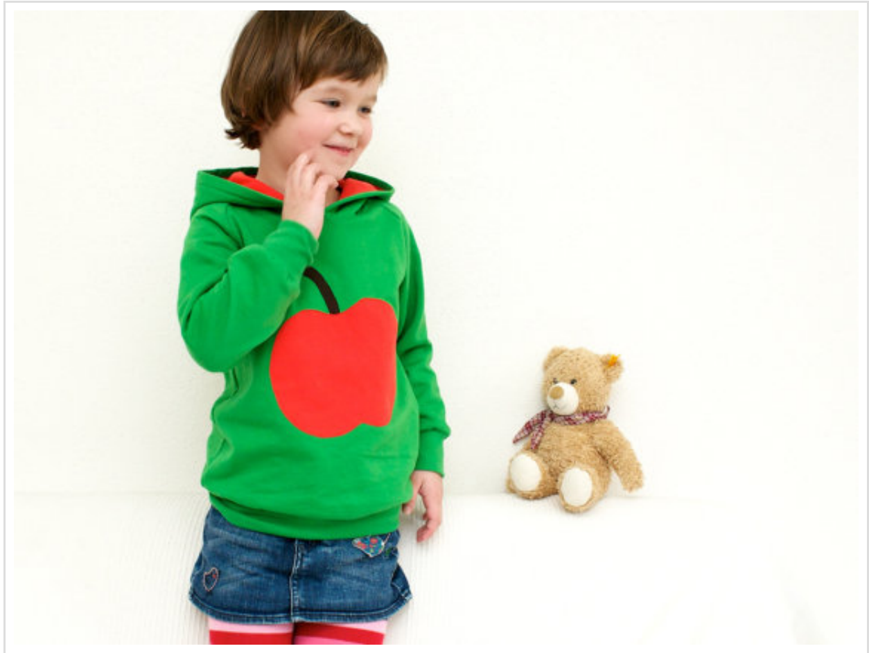
internaht apple hoodie

Our own kids and our friends' kids test the products of internaht every day, and they are proud of them!