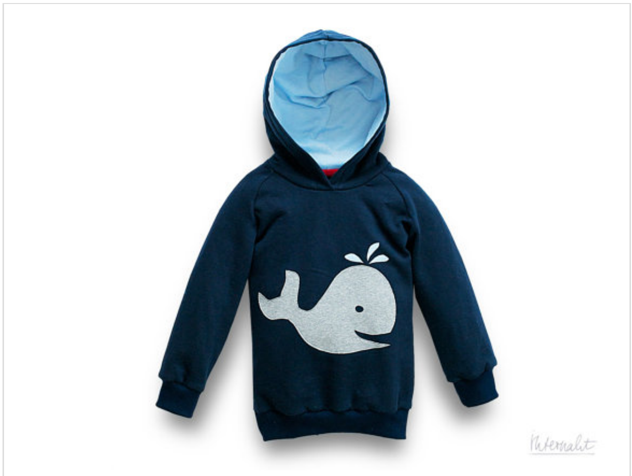
internaht whale hoodie

If you're interested in being considered for a Mompreneur feature (or if you know someone you think would be perfect), shoot me an email at jen@cuddlesandchaos.com .