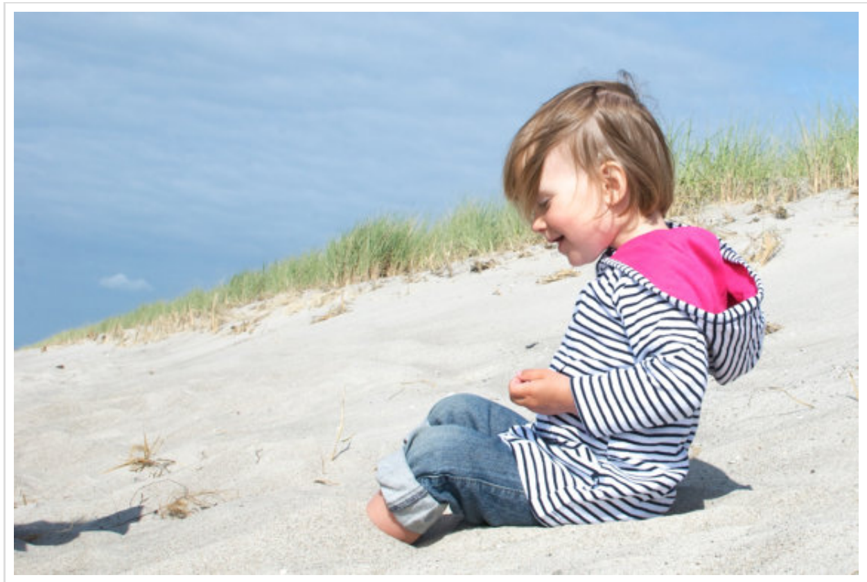
internat kid's beach dress