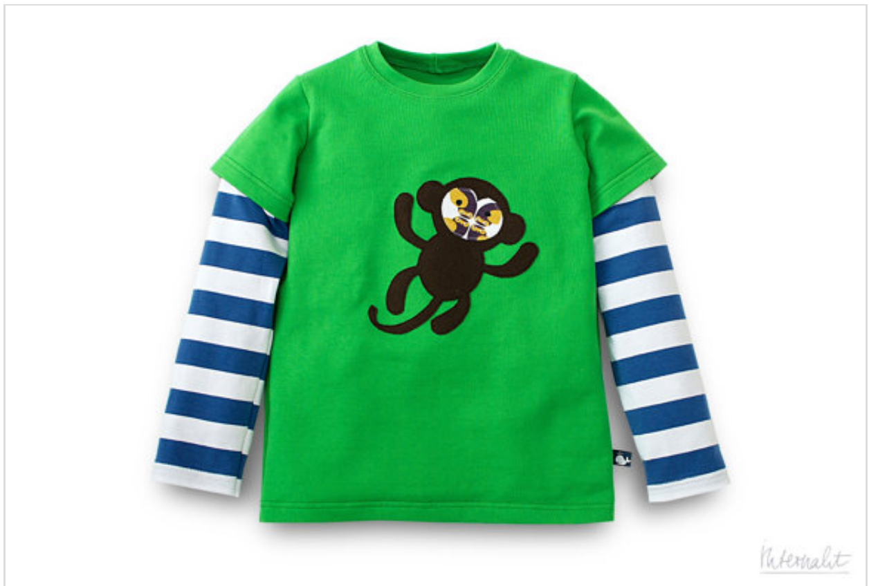
internaht long sleeve monkey t-shirt