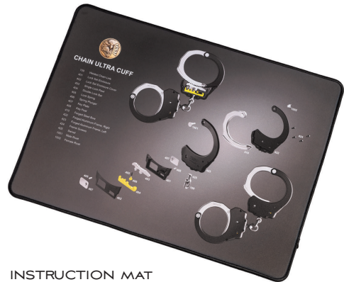
INSTRUCTION MAT CHAIN ULTRA CUFF