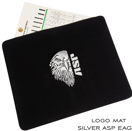
LOGO MAT SILVER ASP EAGLE