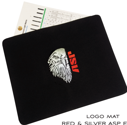
LOGO MAT RED & SILVER ASP EAGLE