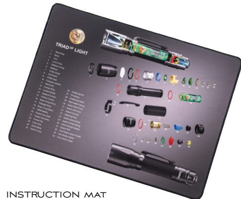
INSTRUCTION MAT TRIAD DF LIGHT