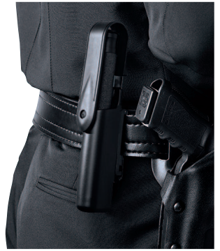
Revolution Scabbards are protective, secure and easily attached.