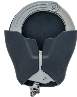
The optional Sentry Cuff Case is specifically designed for ASP Sentry Handcuffs.