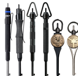
ASP handcuff keys are back set, precision machined and heat treated.