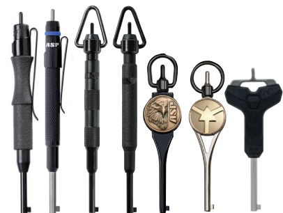
ASP handcuff keys are back set, precision machined and heat treated.