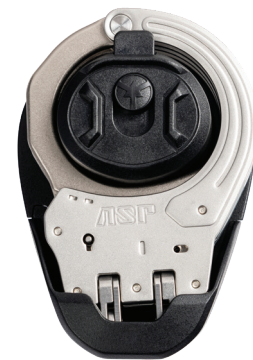
The optional Sentry Exo Case is specifically designed for ASP Sentry Handcuffs.