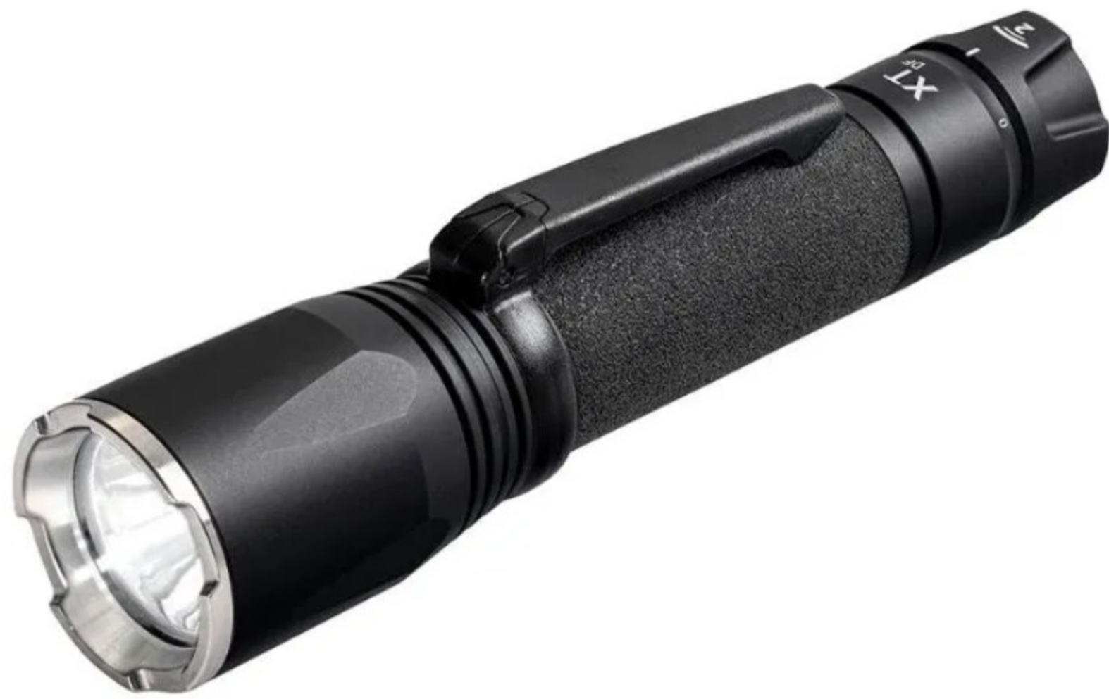
The Armament Systems and Procedures (ASP) XT DF flashlight.

As a member of the special operations community, having reliable and efficient gear is not just a necessity; it's a matter of life and death. The ASP XT DF Flashlight stands out as a beacon of reliability in the tactical equipment arena. Here's a detailed review for SOFREP readers.