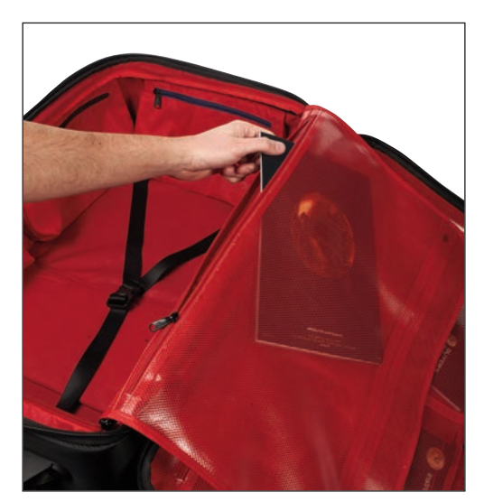
PRODUCT RETAINER BOTTOM ZIPPER