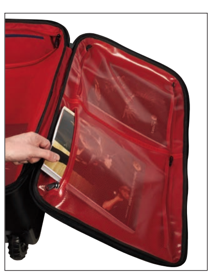
INSIDE COVER BOTTOM ZIPPER