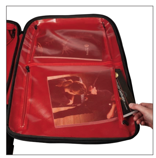
INSIDE COVER TOP ZIPPER