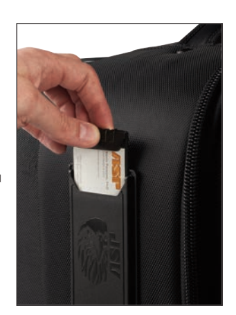
BUSINESS CARD SIZE LUGGAGE IDENTIFICATION