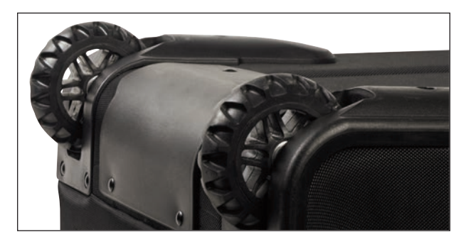
INDUSTRIAL ROLLER BEARING WHEELS