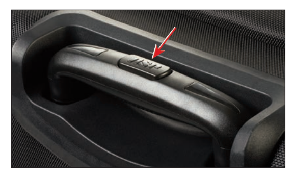
TROLLEY RELEASE BUTTON