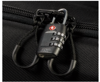
THREE DISC TSA LOCK

ASP Trainers travel the world. They conduct Baton, Restraint and Light training in 102 countries. Their equipment is heavy. Their trips are often long. Organizing, protecting and transporting ASP products for their training requires cases that are designed for the rigors of international travel. The Rolling Training Duffel is that case.