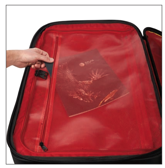
PRODUCT RETAINER TOP ZIPPER