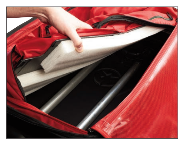
TROLLEY TUBE PROTECTIVE COVER