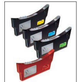
Replaceable Lock Sets are also available in two, three and slip pawl designs.