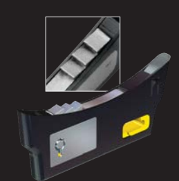
TACTICAL (1 Pawl)

The high visibility single pawl Lock Set is both strong and shim resistant.