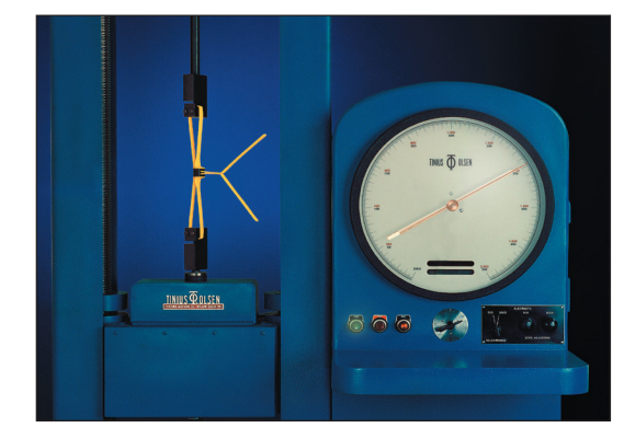
Strength Tested for safety.