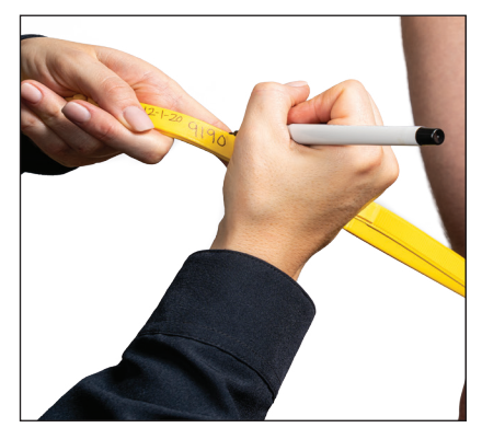
Tri-Folds® feature a textured writing surface.