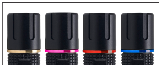
The Dot comes in a variety of colored accent rings.