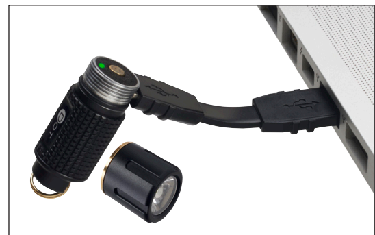
The included Micro Flex allows Dot charging with any computer or USB port .