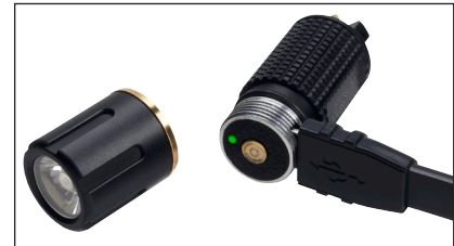
An LED indicator turns from flashing red to solid green when the Dot is fully charged.