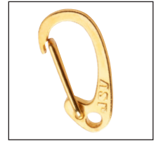
Detachable Clips allow attachment and convenient removal of the Dot.