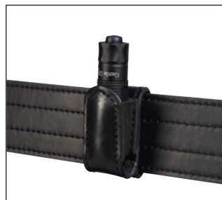
Light Keepers are slim, compact and match the duty belt.