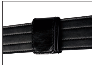
Double Wide Belt Keepers allow precise positioning of equipment on the duty belt.