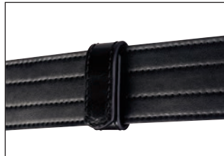
Belt Keepers align the duty belt, under belt and equipment.