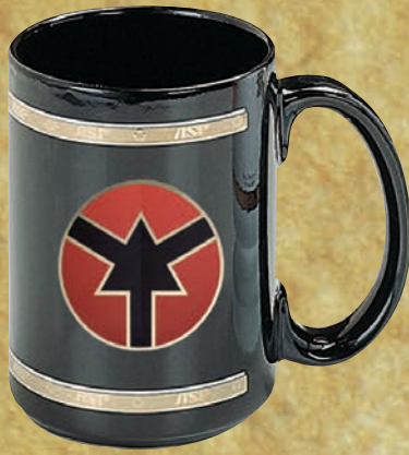
Instructor Mug Ceramic 09400